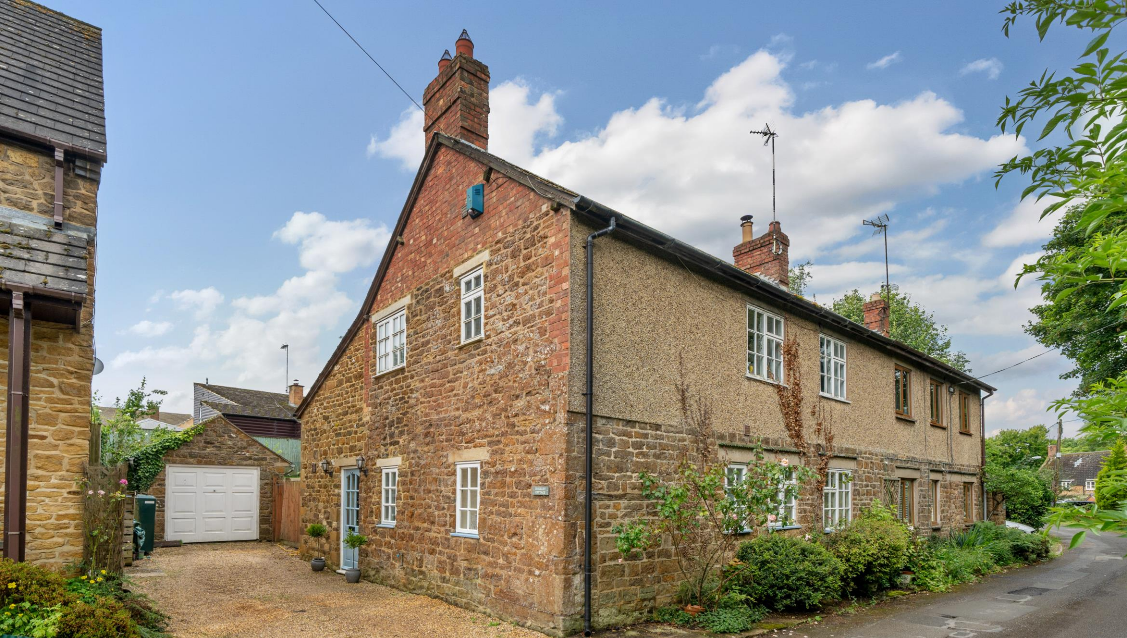
Checkley Cottages, Chapel Lane, Charwelton, Northamptonshire, NN11 3YU