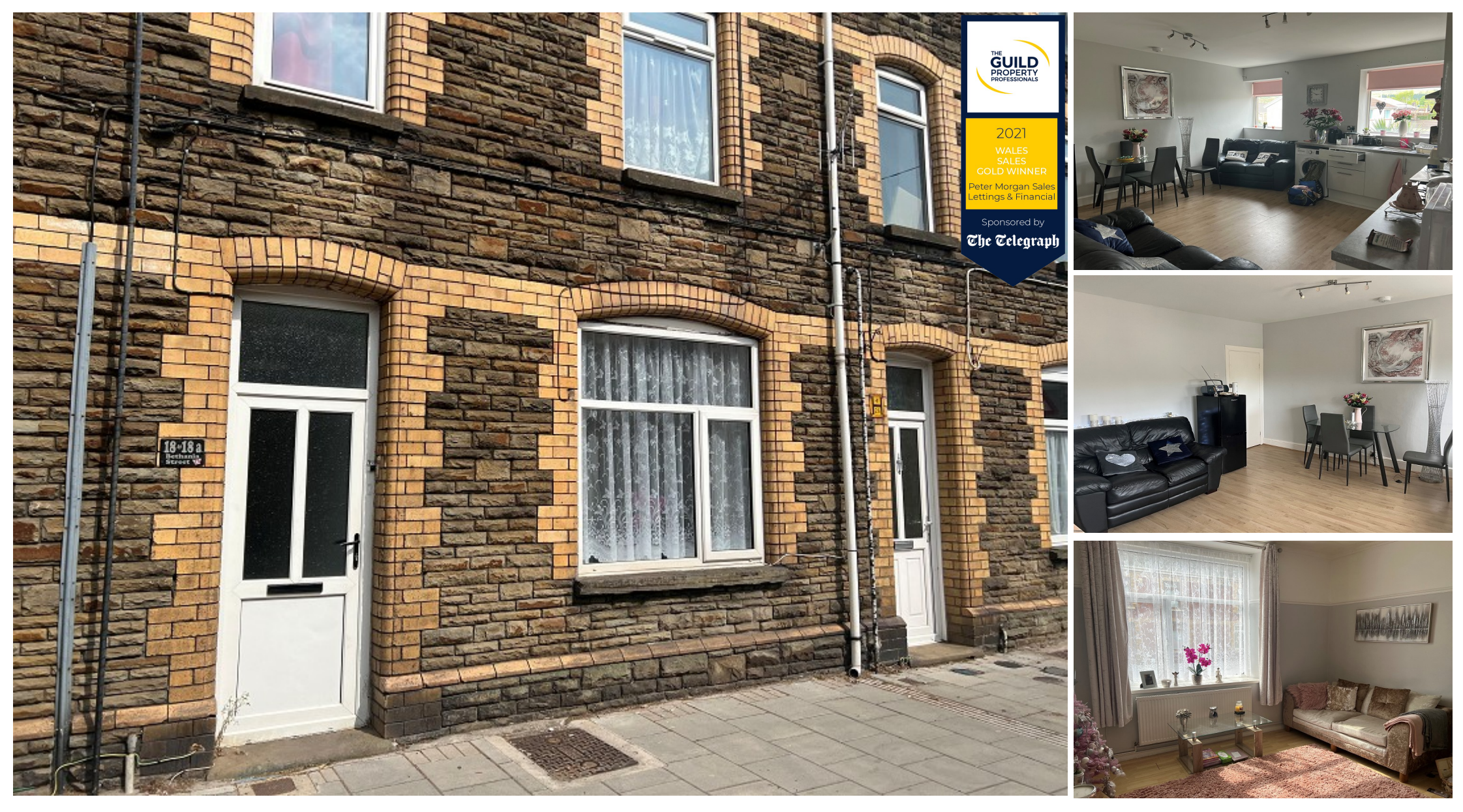
18 Bethania Street, Maesteg, Bridgend. CF34 9EJ