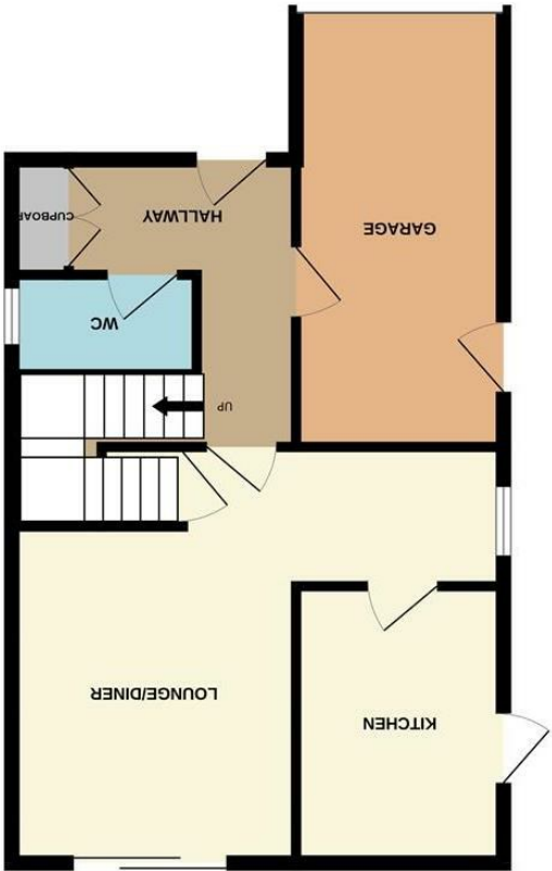
GROUND FLOOR 542 sq.ft. (50.3 sq.m.) approx.