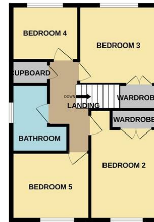
1ST FLOOR 522 sq.ft. (48.5 sq.m.) approx.