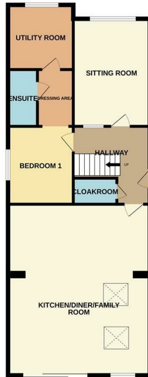
GROUND FLOOR 908 sq.ft. (84.4 sq.m.) approx.