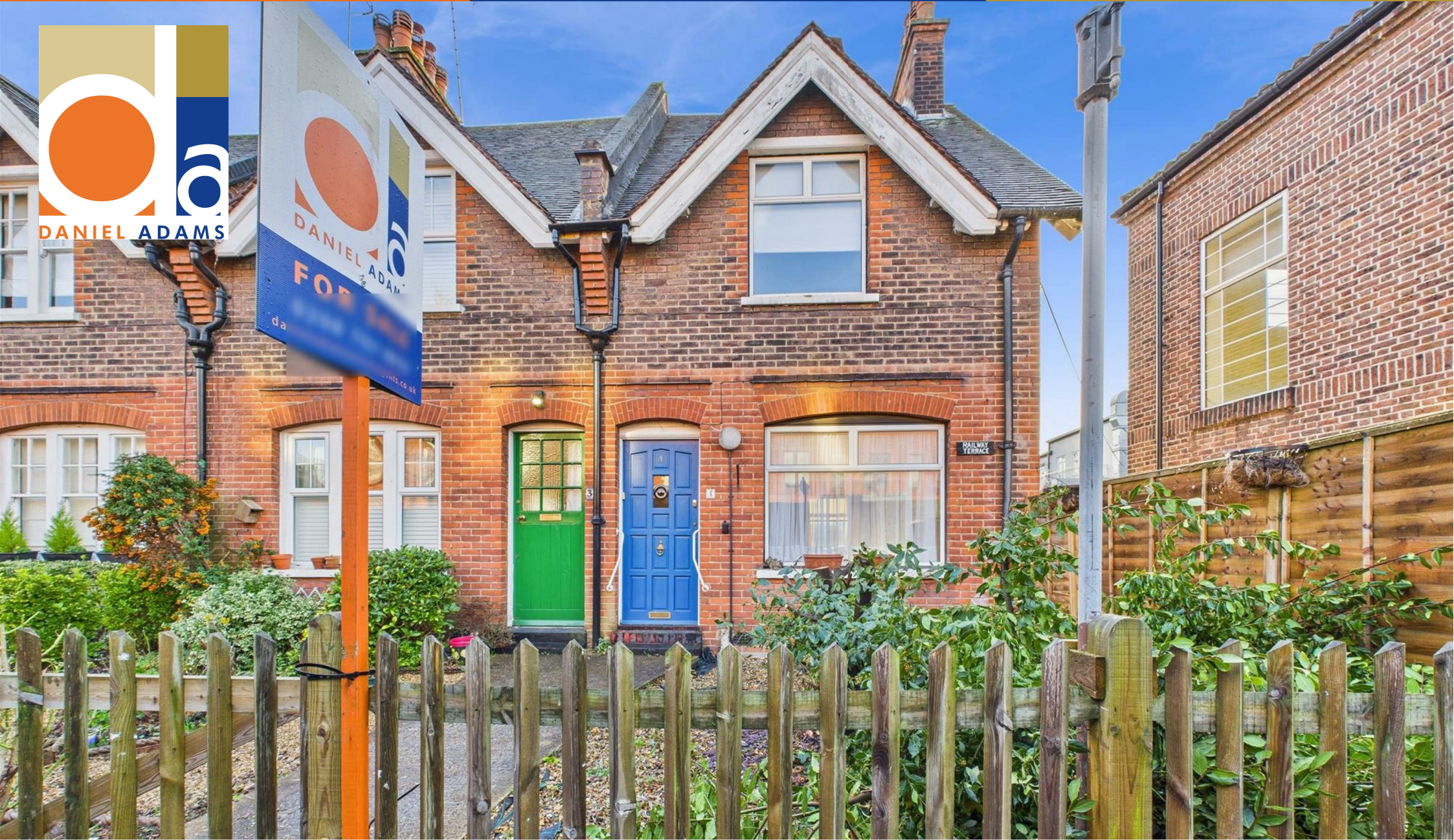
4 Railway Terraced Station Approach Coulsdon North Coulsdon, CR5 2NR