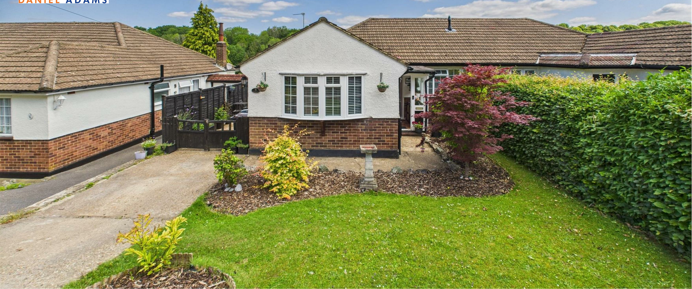
6 Rydens Wood Close Coulston, CR5 1ST