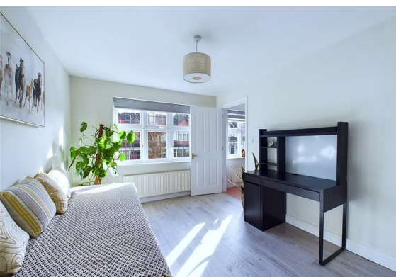
Bedroom 11'9" x 9'4" (3.6m x 2.87m)