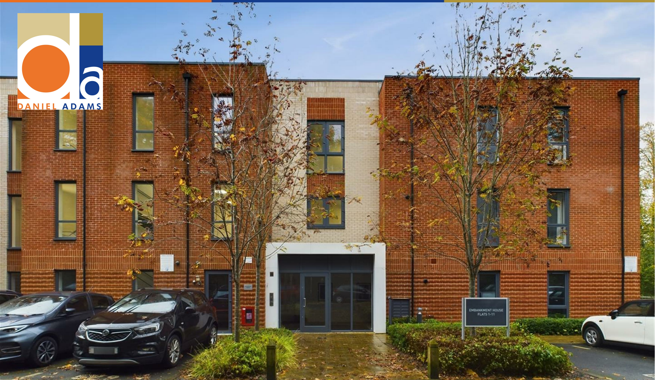
Flat 3, Embankment House 1 Iron Railway Close Coulson, CR5 3JW