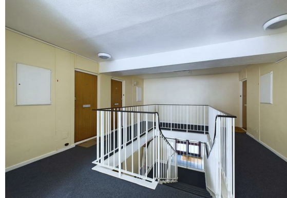
Entrance Hall 5'11" x 5'7" (1.82m x 1.72m)