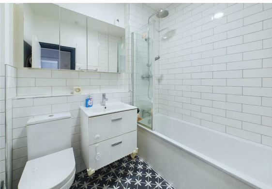
Bathroom 5'7" x 7'6" (1.71m x 2.31m)