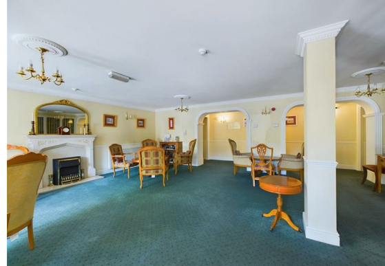
Entrance Hall 13'3" x 3'6" (4.04m x 1.07m)