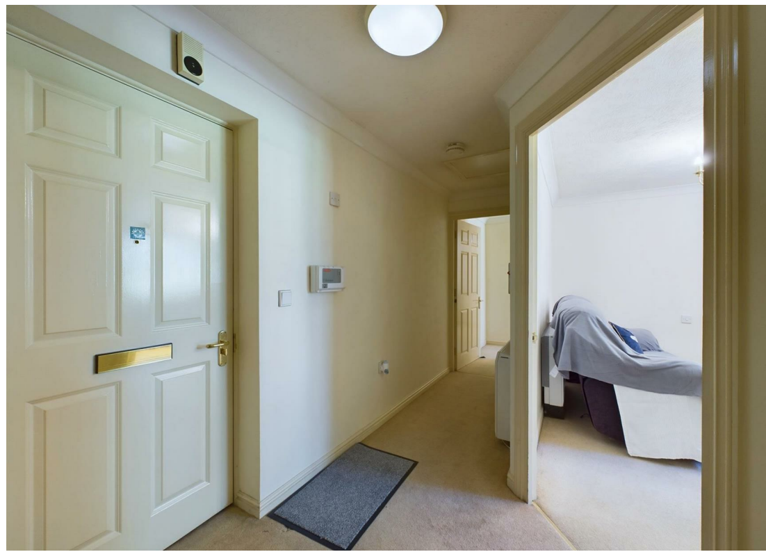
Entrance Hall 13'3" x 3'6" (4.04m x 1.07m)