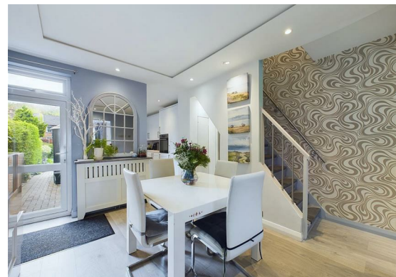
Kitchen 11'8" x 13'7" (3.57m x 4.16m)