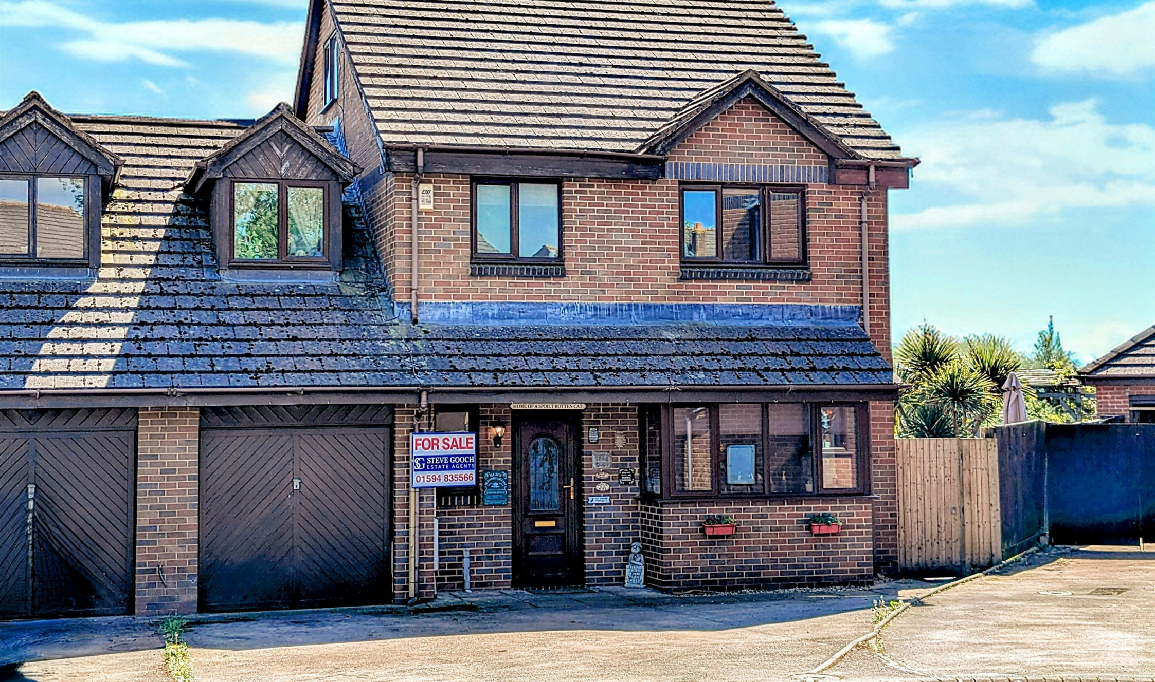
6 Old Furnace Close Lydney GL15 5FB