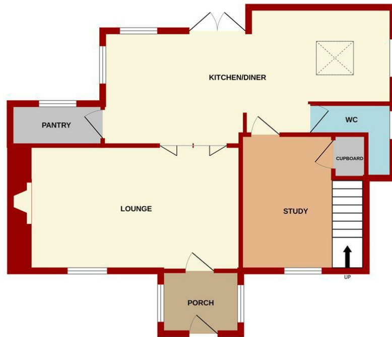
GROUND FLOOR 688 sq.ft. (63.9 sq.m.) approx.