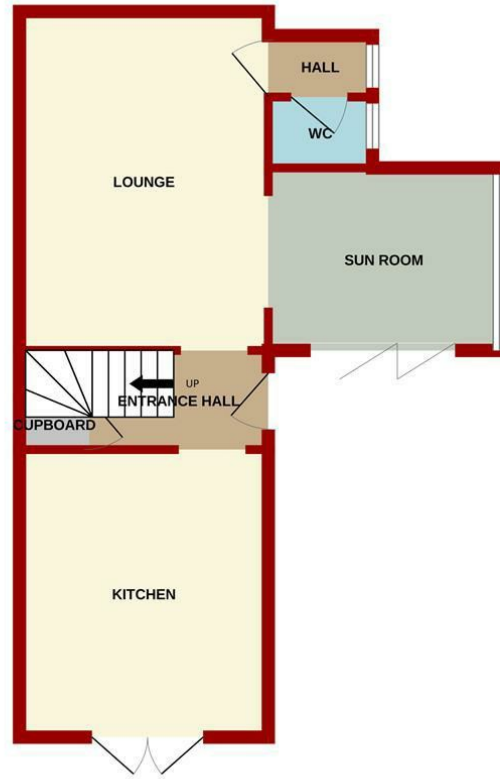
GROUND FLOOR 464 sq.ft. (43.1 sq.m.) approx.