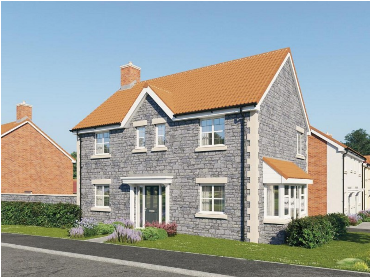
THE BOWYER, AXBRIDGE, SOMERSET. BS26 2BJ