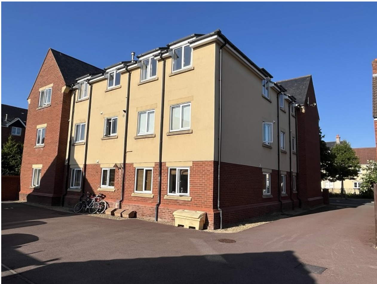
GRIFFEN ROAD, WESTON-SUPER-MARE, BS24 7HG