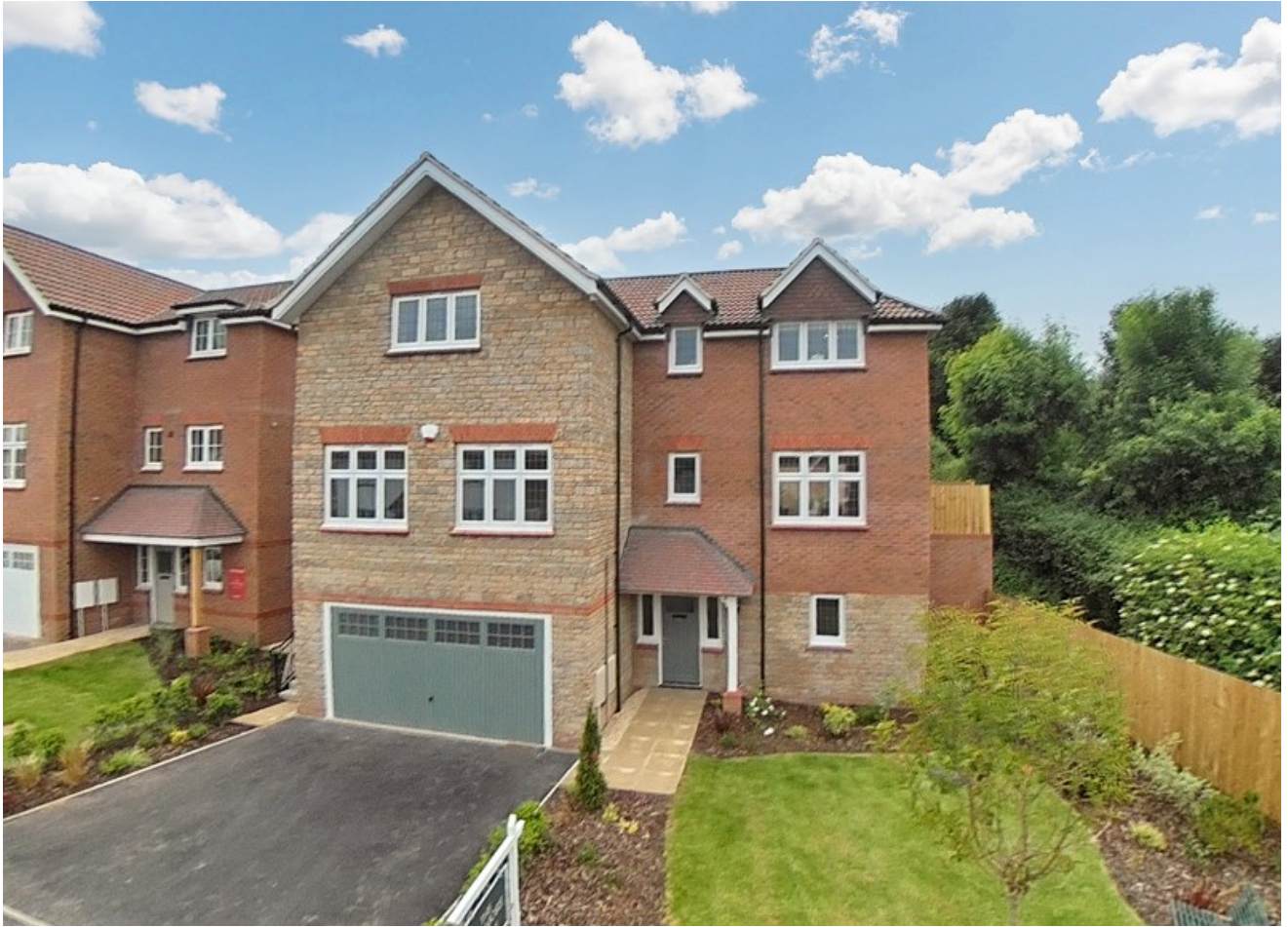
WOODBOROUGH GRANGE, WOODBOROUGH ROAD,