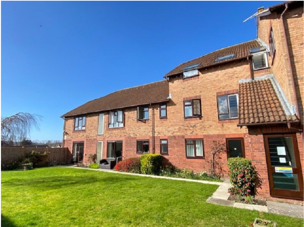
MENDIP LODGE, WINSCOMBE, NORTH SOMERSET. BS25 1HN