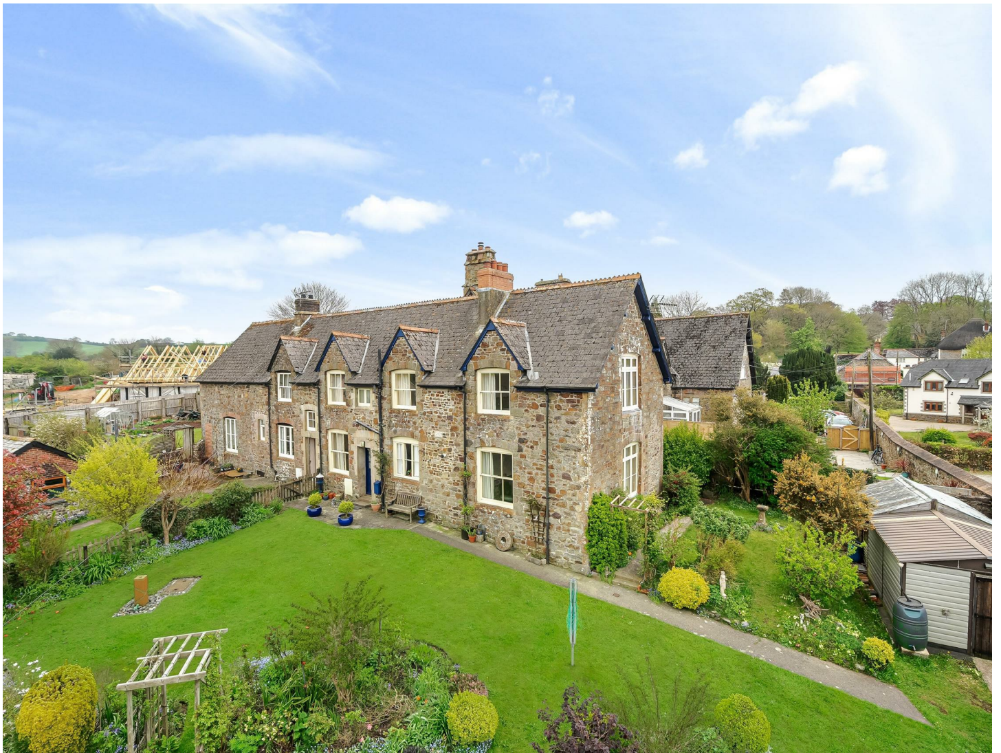
3 Devonshire House