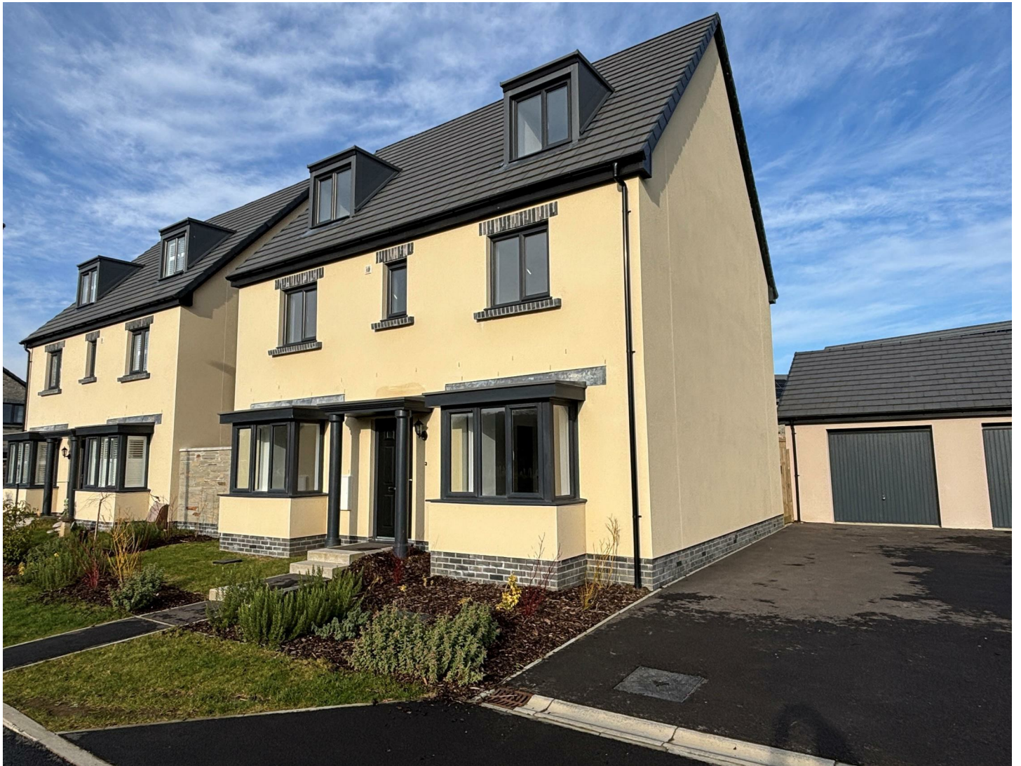
3 Bluebell View