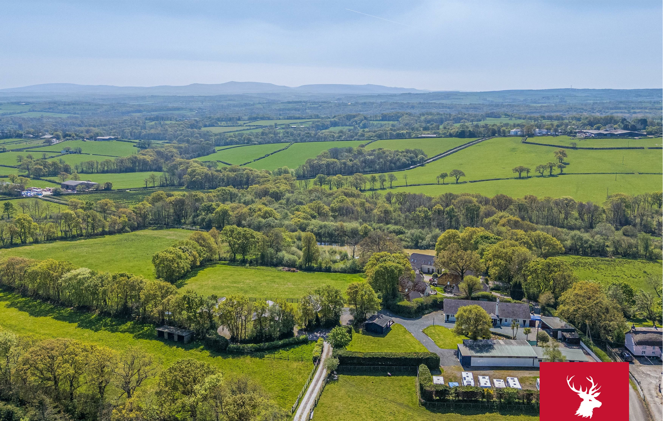
South Trew Stables