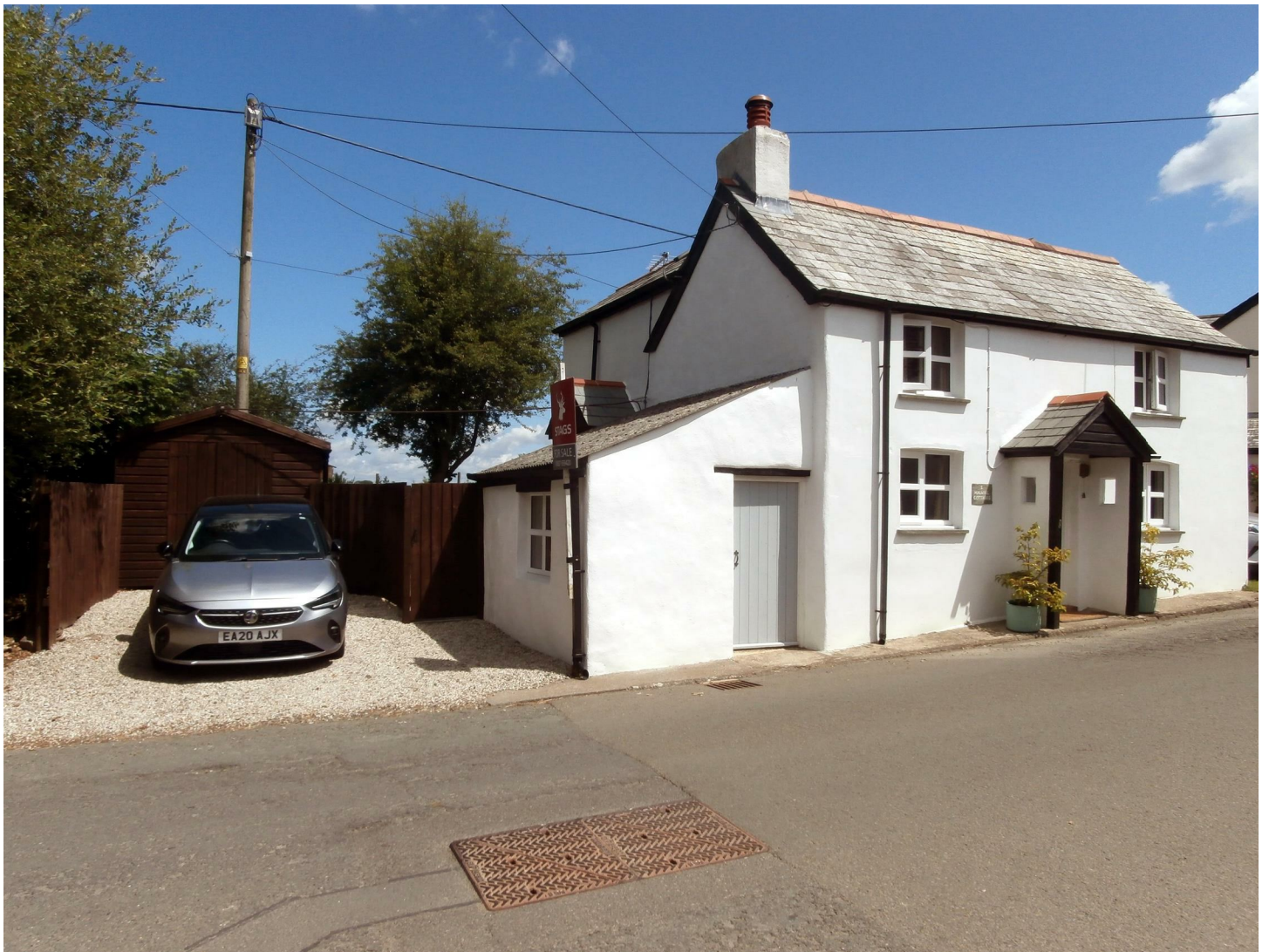
1 Halwill Cottages