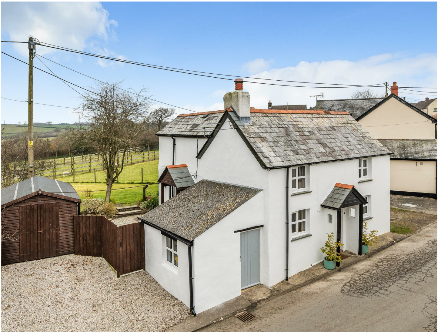
1 Halwill Cottages