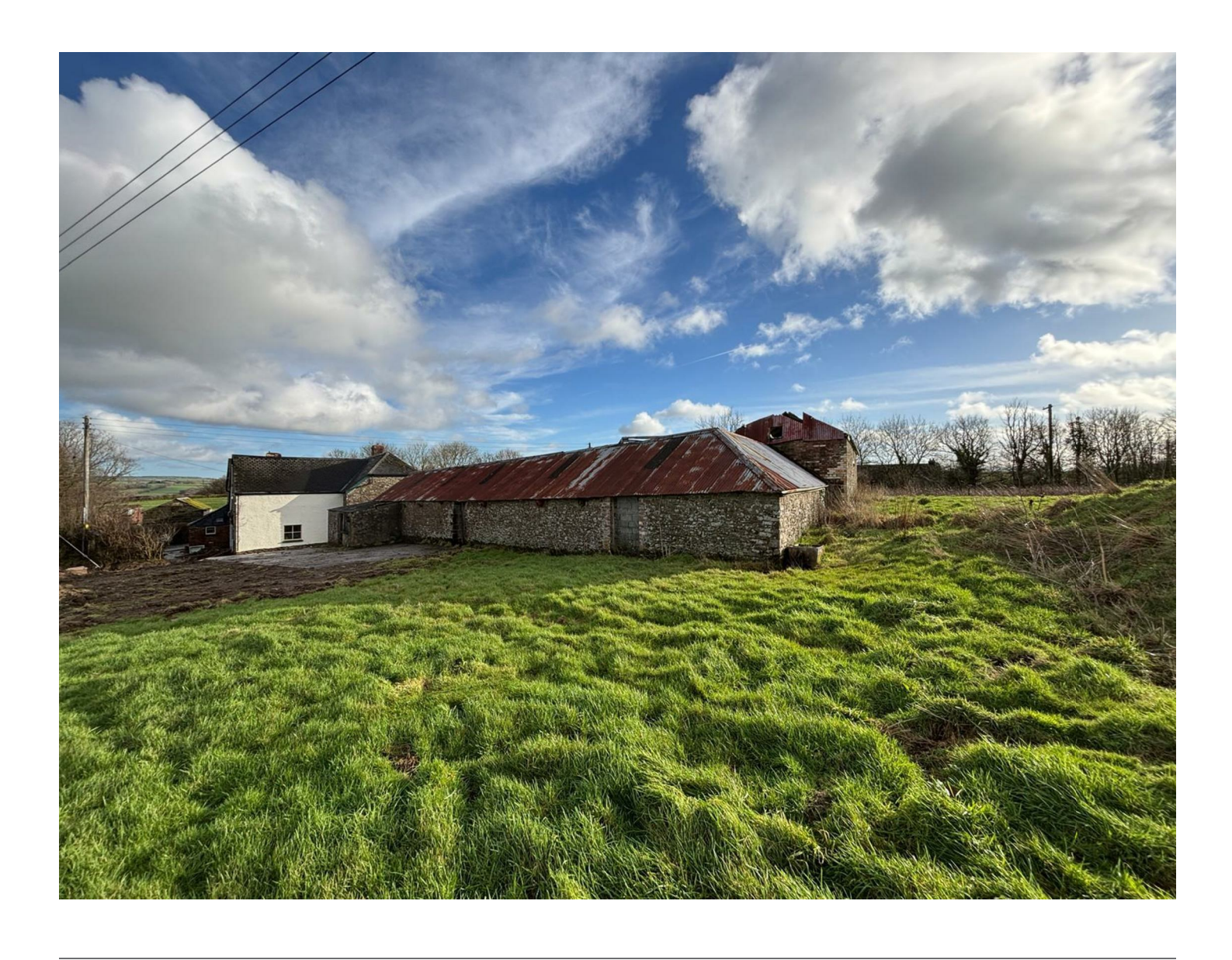
Barn 1 Aish Barton