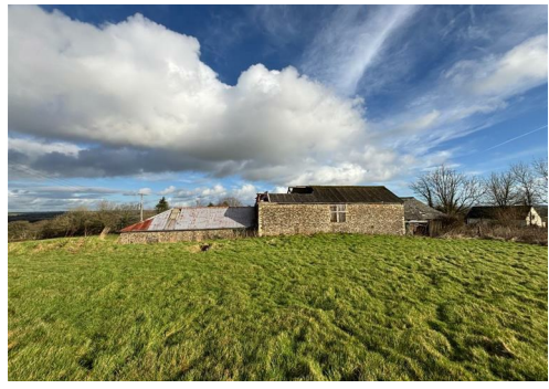
Hatherleigh 3.5 Miles, Okehampton 10.5 Miles.

An exciting opportunity to purchase a Grade II listed semi detached barn with PP for conversion, with provision for garden, paddock and allocated parking.