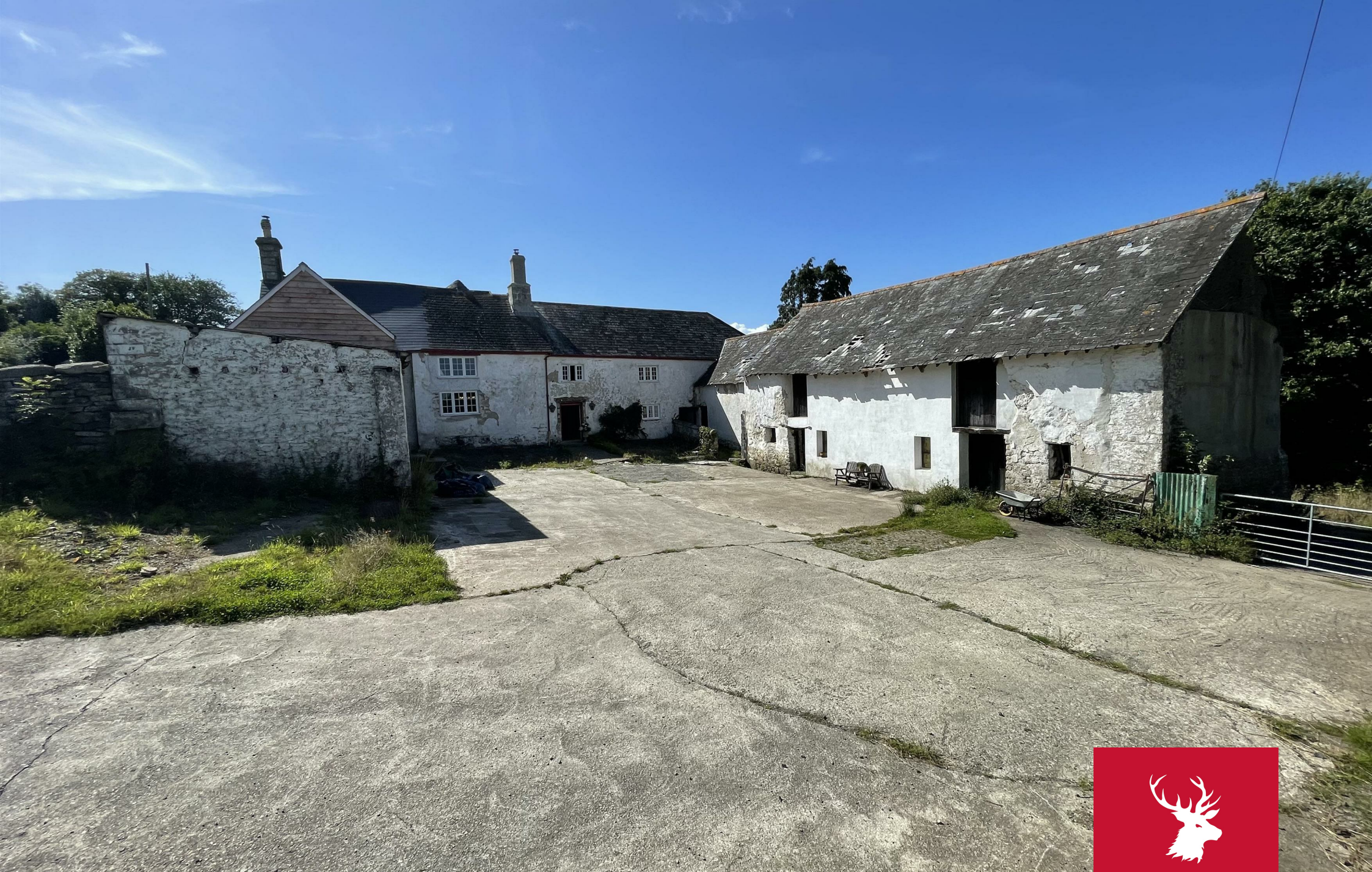
Reddaway Farm, Sticklepath