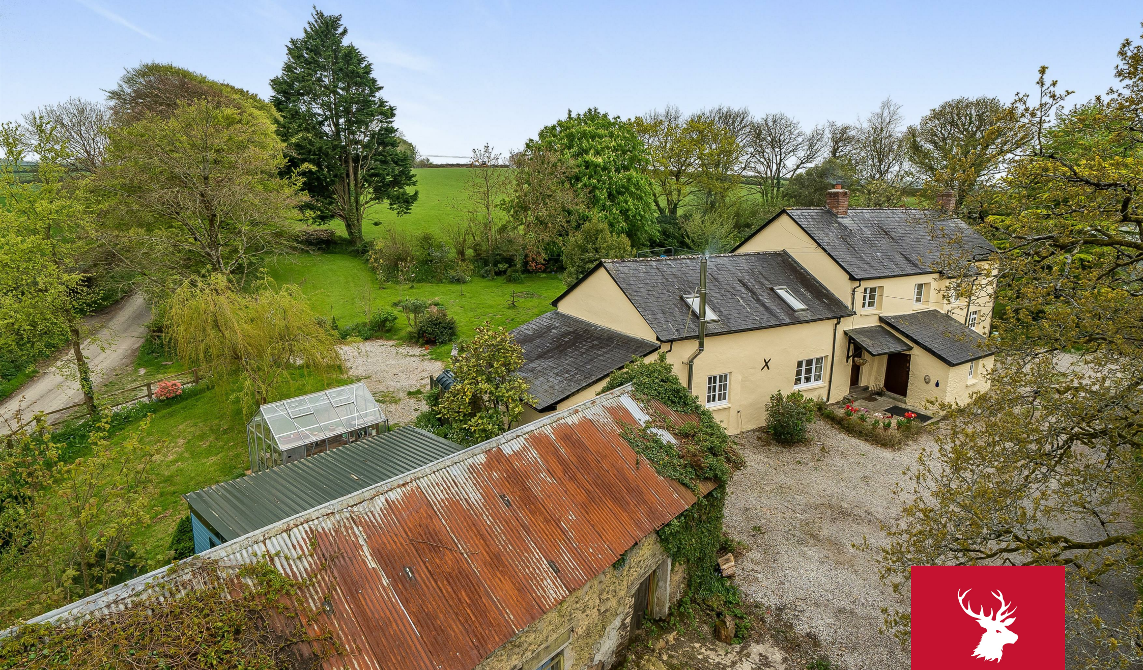
West Kimber Farm