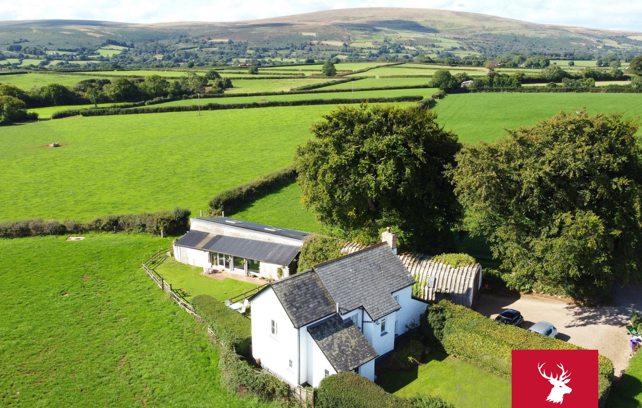
Hare Path Cottage