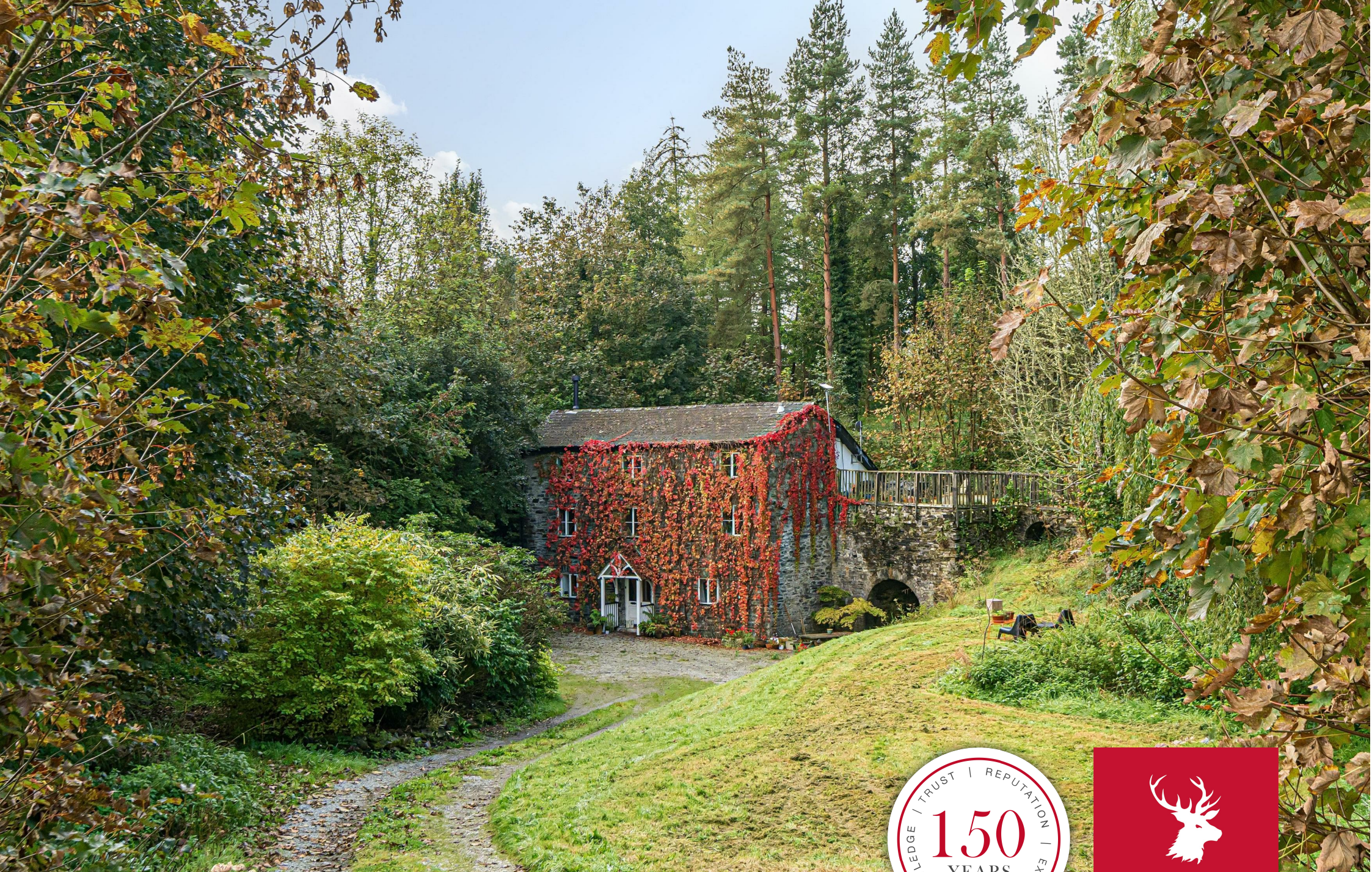
The Old Lime Kiln