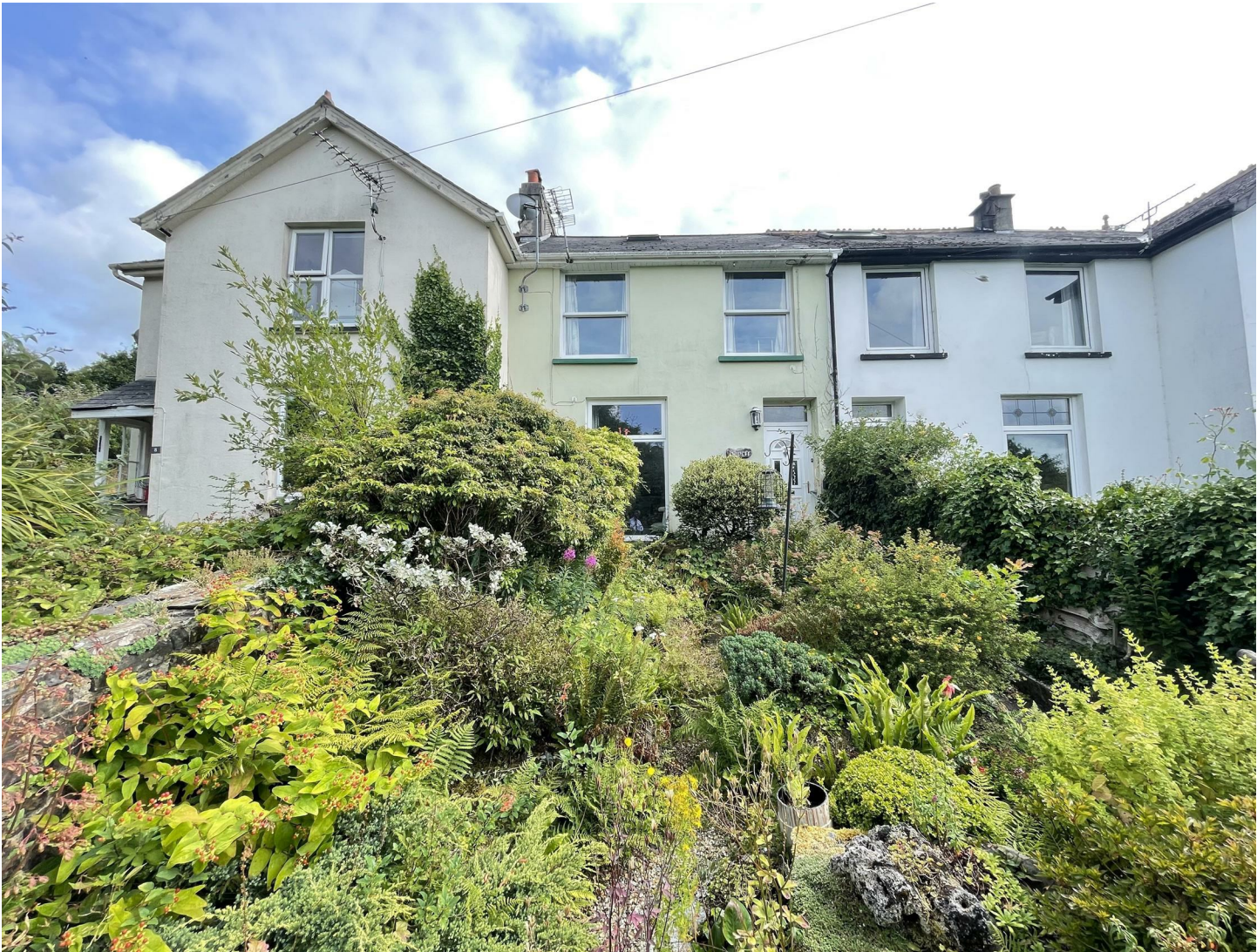
7 Park View Terrace