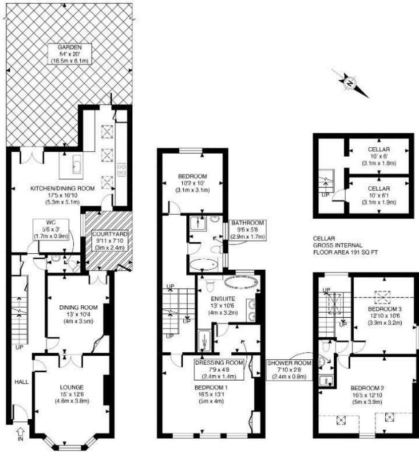
GROUND FLOOR GROSS INTERNAL FLOOR AREA 800 SQ FT