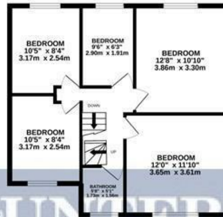
1ST FLOOR 592 sq.ft. (55.0 sq.m.) approx.