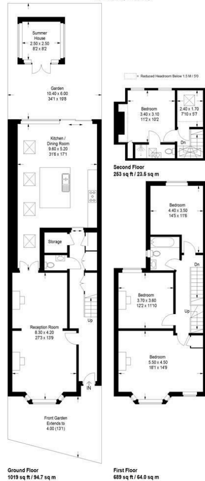
Illustration for identification purposes only, measurements are approximate, not to scale. floorplansUsketch.com © (ID1091736)

Approximate Gross Internal Area = 182.2 sq m / 1961 sq ft Summer House = 6.5 sq m / 70 sq ft Total = 188.7 sq m / 2031 sq ft