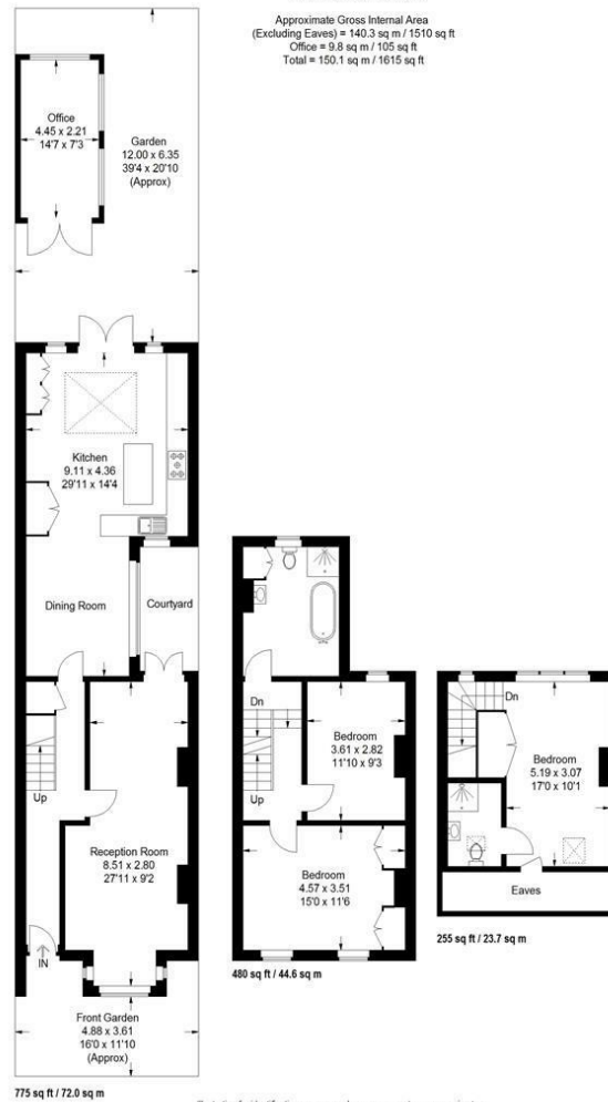
Illustration for identification purposes only; measurements are approximate, not to scale. floorplansuk.sketch.com © (j)D1081624

Approximate Gross Internal Area (Excluding Eaves) = 140.3 sq m / 1510 sq ft Office = 9.8 sq m / 105 sq ft Total = 150.1 sq m / 1615 sq ft