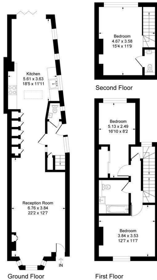
Illustration for identification purposes only, measurements are approximate, not to scale. Produced By Esjay Property Marketing

Care has been taken in the preparation of these particulars, however, their accuracy is not guaranteed and they do not form part of any contract. Measurements stated must be considered maximum.