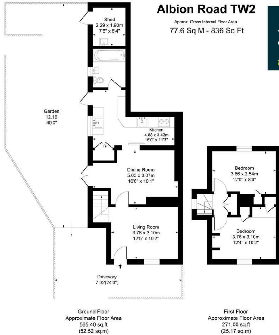
Illustration for identification purposes only, measurements are approximate, not to scale. Produced By Esjay Property Marketing