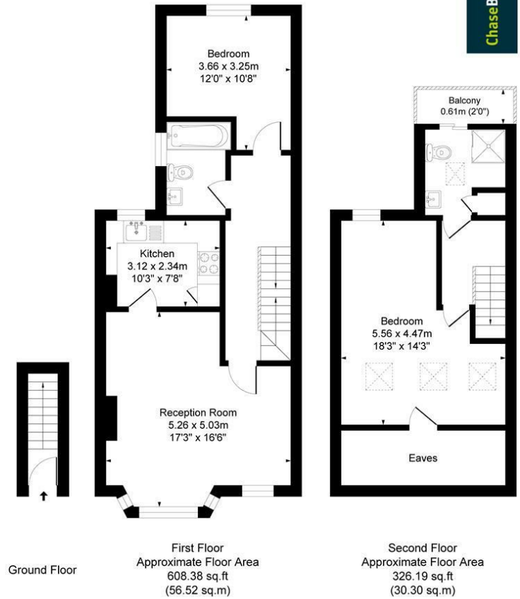
Illustration for identification purposes only, measurements are approximate, not to scale. Produced By Esjay Property Marketing

Care has been taken in the preparation of these particulars, however, their accuracy is not guaranteed and they do not form part of any contract. Measurements stated must be considered maximum.