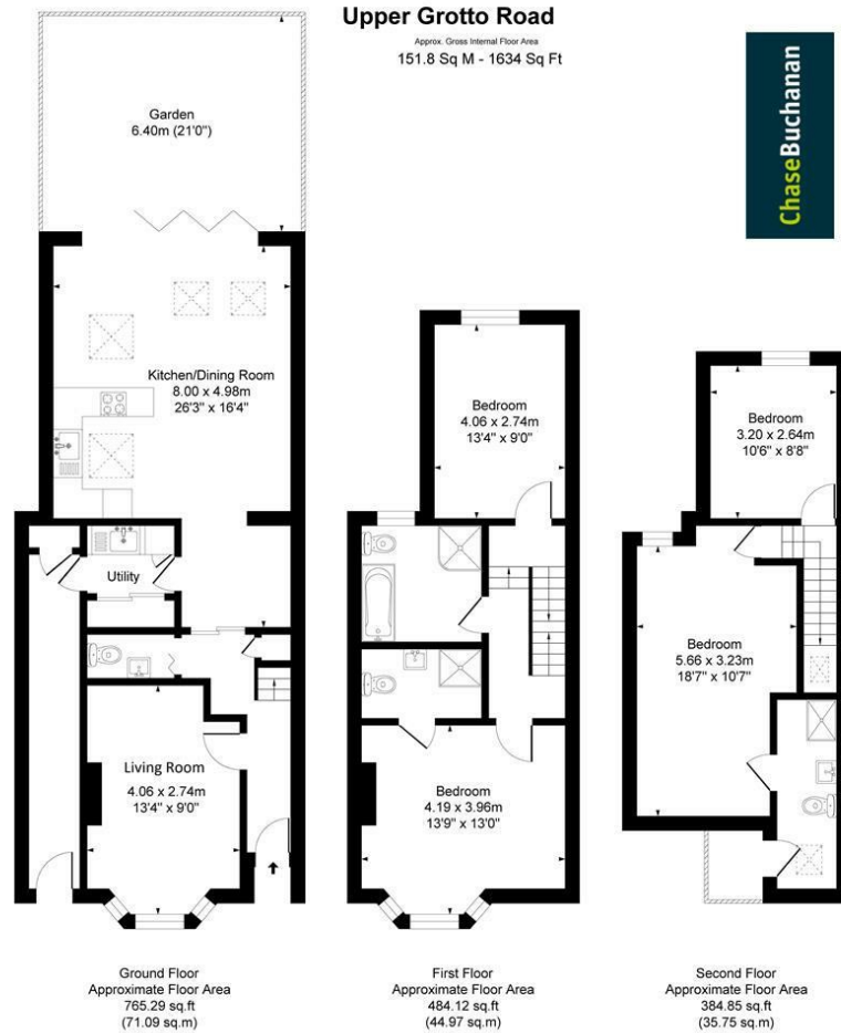
Illustration for identification purposes only, measurements are approximate, not to scale. Produced By Esjay Property Marketing

Care has been taken in the preparation of these particulars, however, their accuracy is not guaranteed and they do not form part of any contract. Measurements stated must be considered maximum.