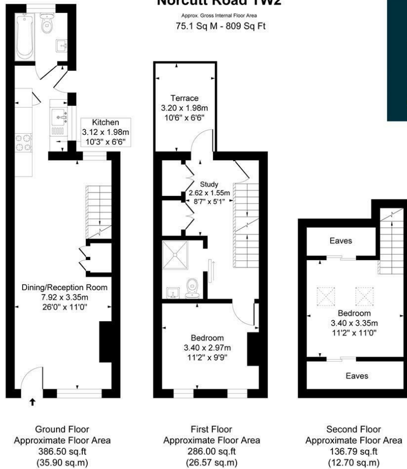
Illustration for identification purposes only, measurements are approximate, not to scale. Produced By Esjay Property Marketing

Care has been taken in the preparation of these particulars, however, their accuracy is not guaranteed and they do not form part of any contract. Measurements stated must be considered maximum.