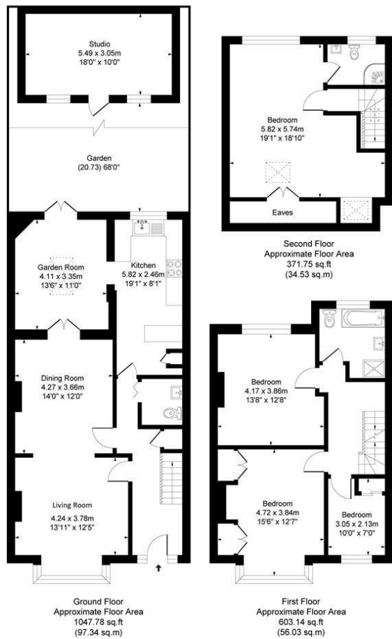
Illustration for identification purposes only, measurements are approximate, not to scale. Produced By Eijay Property Marketing

Care has been taken in the preparation of these particulars, however, their accuracy is not guaranteed and they do not form part of any contract. Measurements stated must be considered maximum.