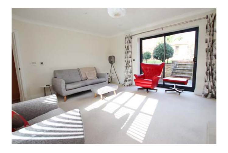
Well located village home with comfortable spaces