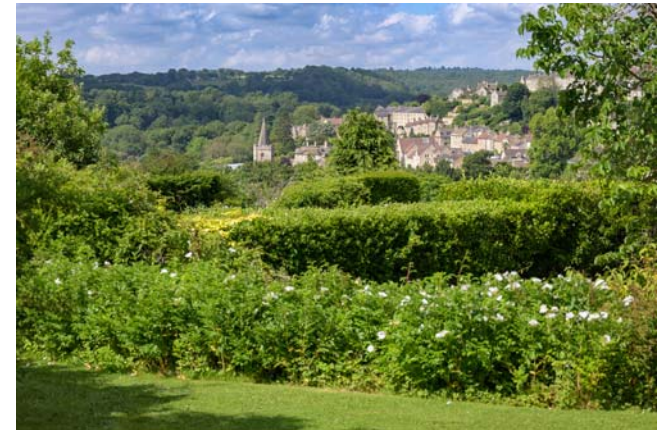
Stunning views across the town to hillsides beyond