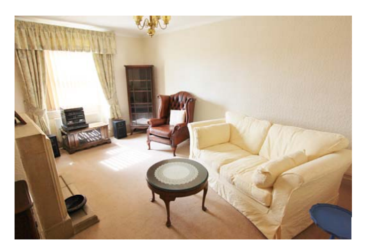
Period home with commanding views