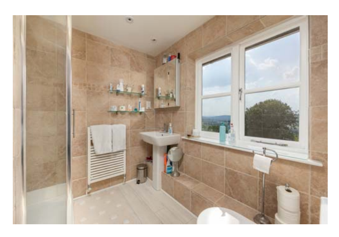
Four bedrooms & two bathrooms