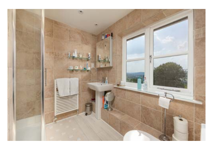
Four bedrooms & two bathrooms