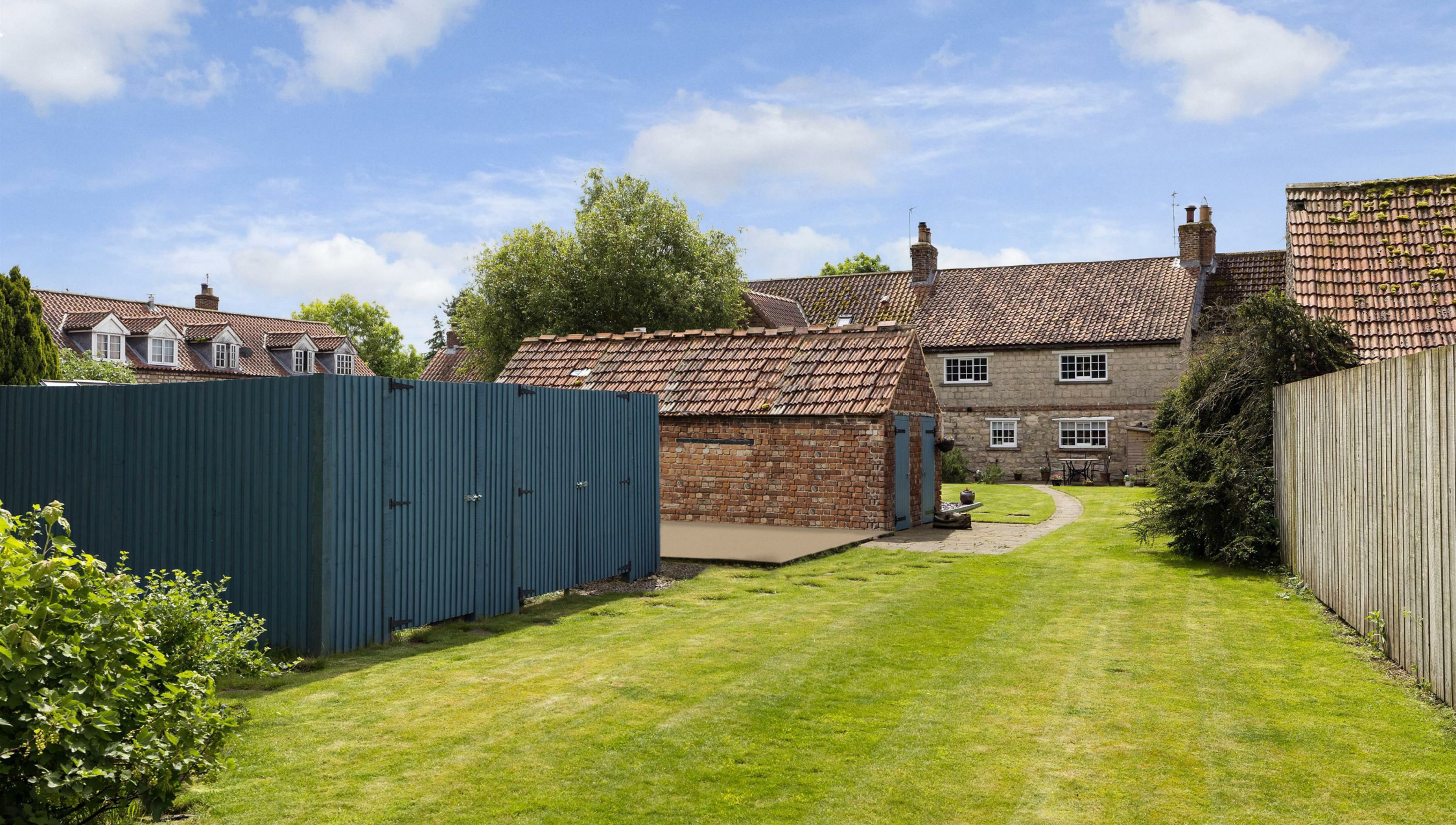
Plum Tree Cottage, 2 Town Street | Settrington, Malton