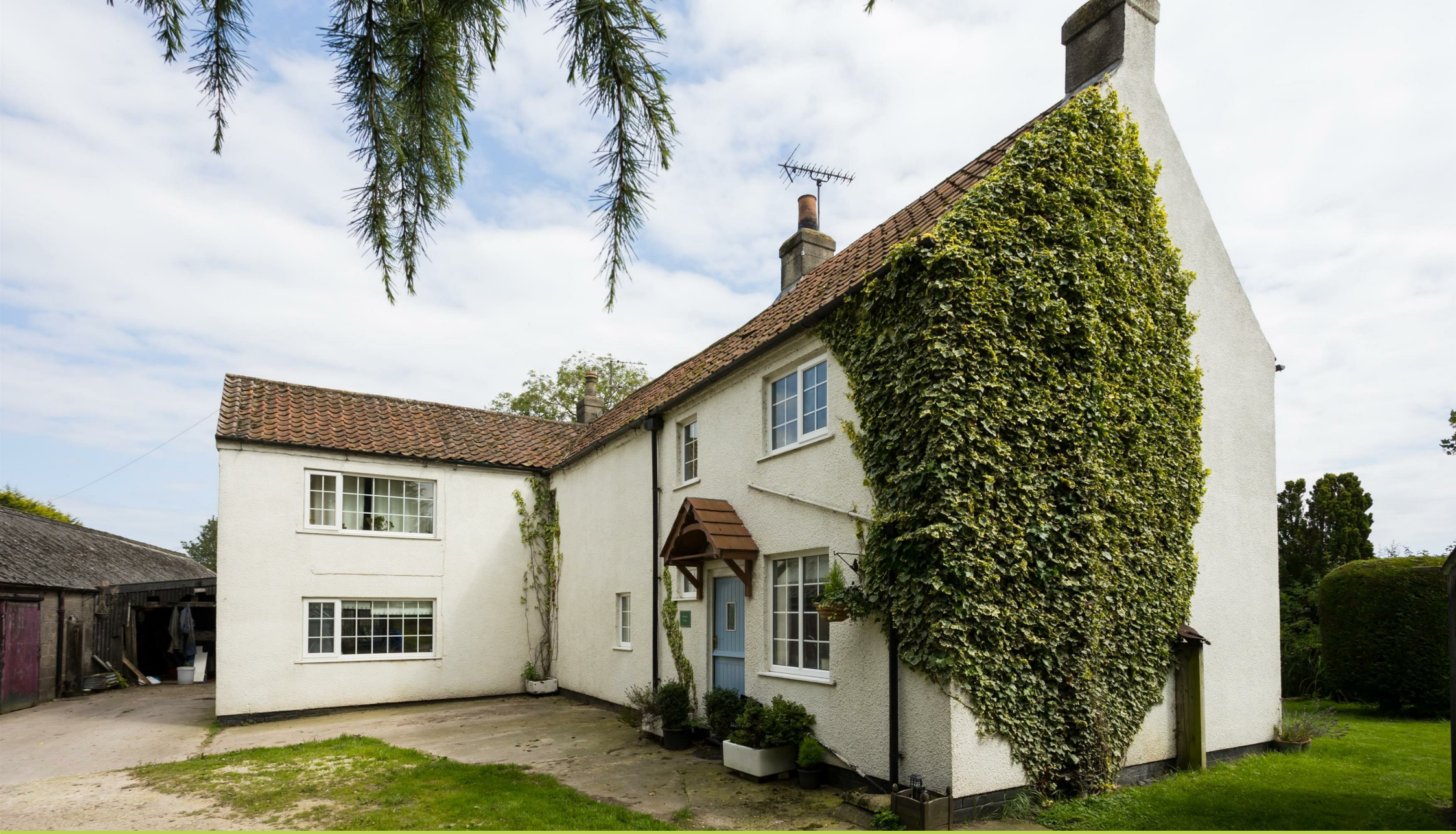
Heapfield Farm, Wansford Road | Nafferton, Driffield, YO25 8NJ