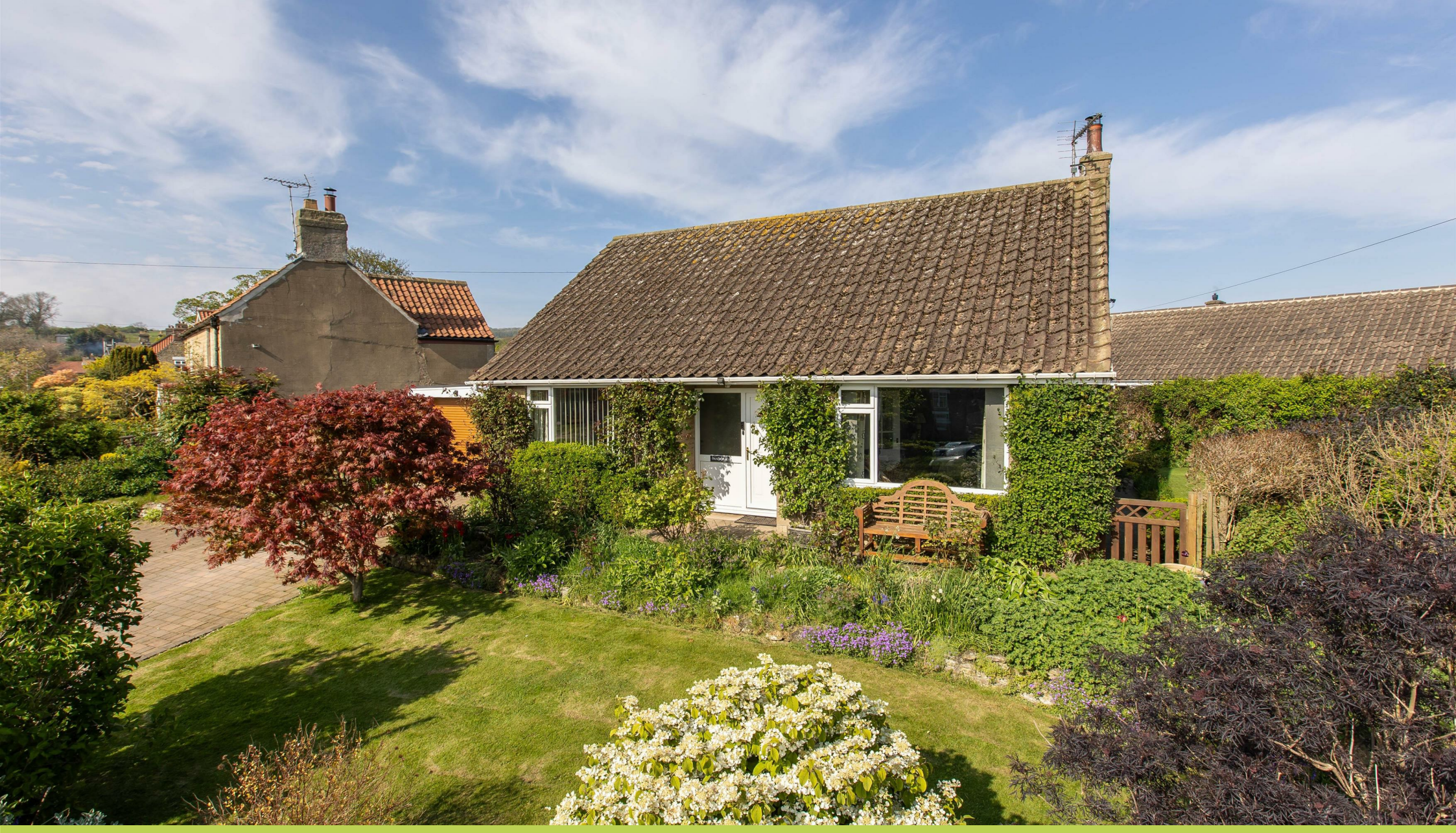
Pandora | Wilton, Pickering, YO18 7LE