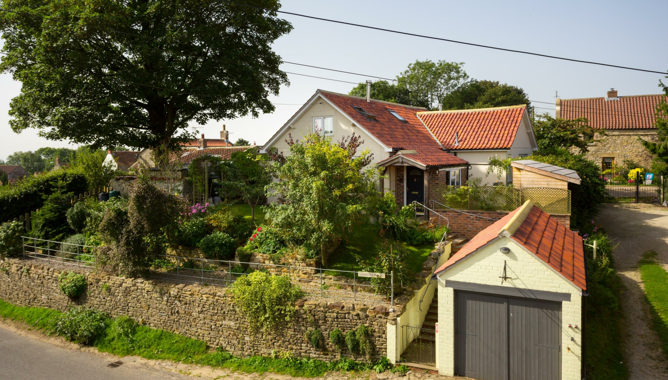
Laburnum House | Newton upon Rawcliffe, Pickering, YO18 8QA